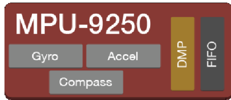
9-Axis Invensense MPU-9250 MEMS Motion Tracking Sensor